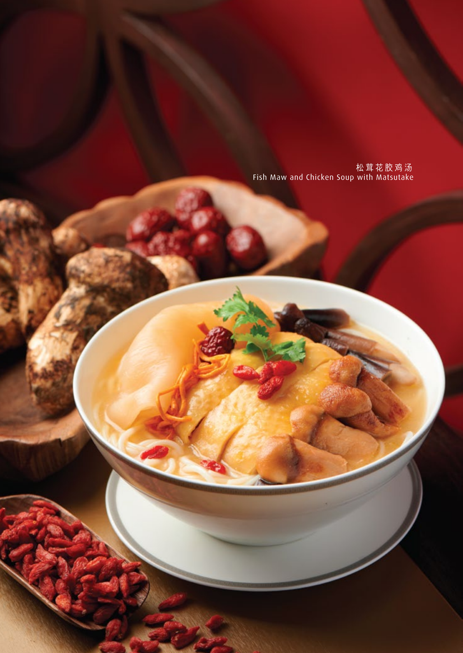
松茸花胶鸡汤 Fish Maw and Chicken Soup with Matsutake

蚝皇鲍鱼鹅掌捞面 228 Tossed Egg Noodles with Braised Abalone and Goose Webs