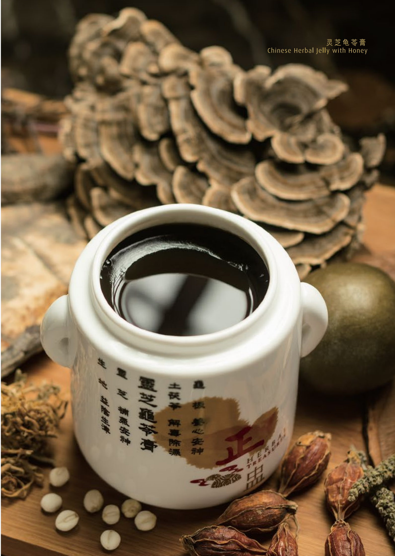
灵芝龟苓膏 Chinese Herbal Jelly with Honey

请告知您的服务员关于任何食物过敏或餐饮限制。所有价格为澳门币并需加收10%服务费。图片只供参考之用。 Please inform our service staff if you have any food allergies or dietary requirements. All prices are in MOP and subject to a 10% service charge. Photos are for reference only.