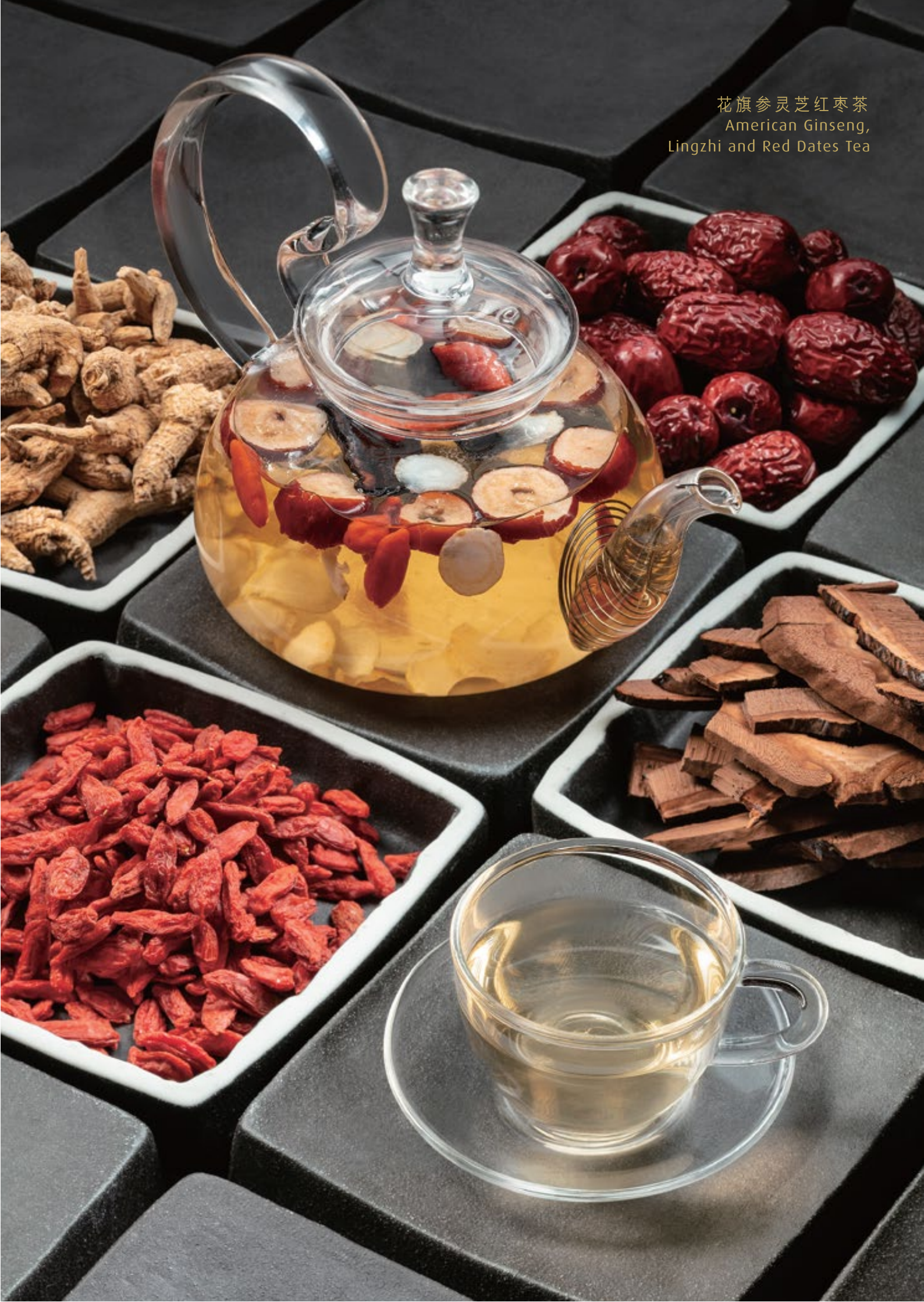
花旗参灵芝红枣茶 American Ginseng, Lingzhi and Red Dates Tea