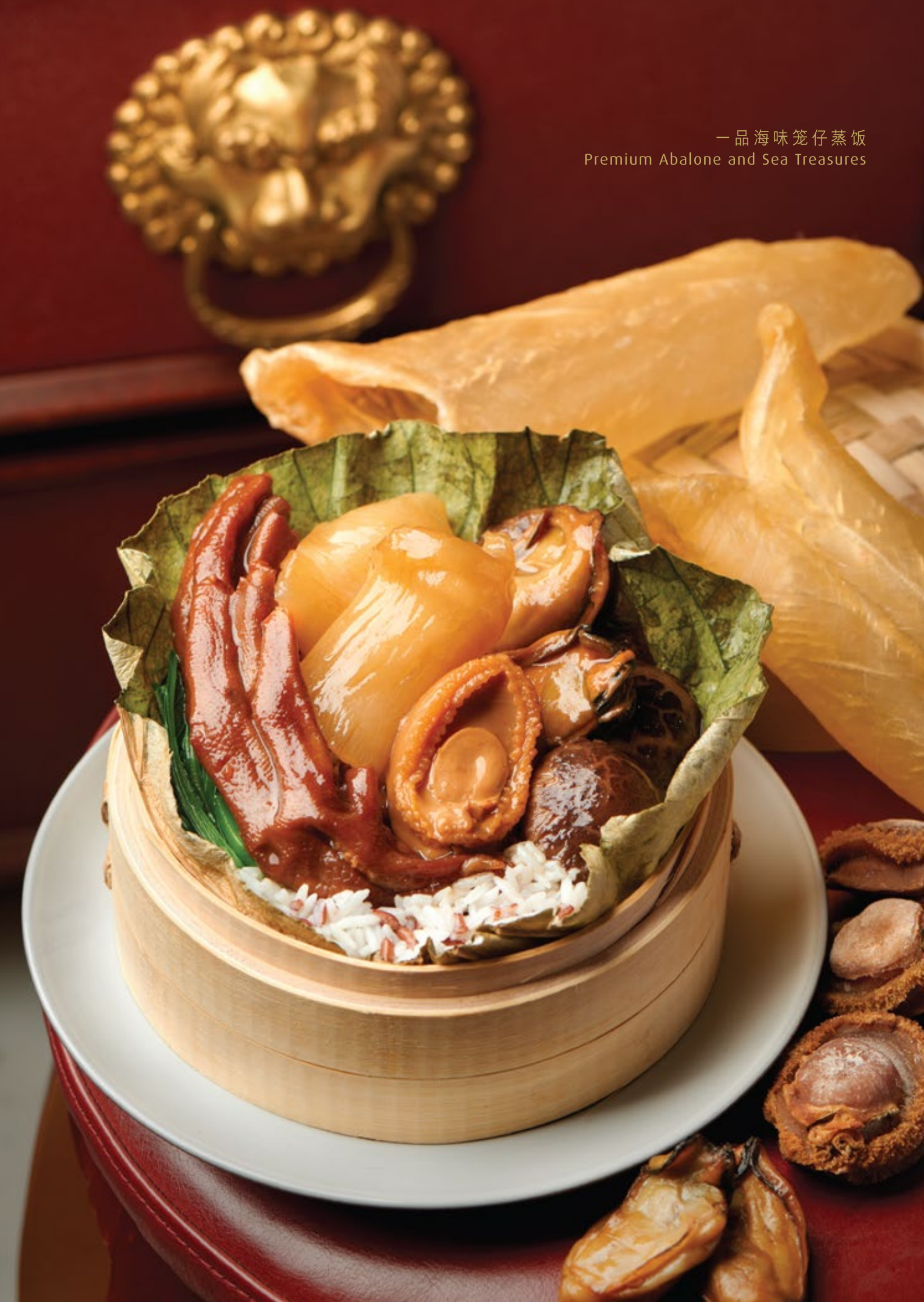
一品海味笼仔蒸饭 Premium Abalone and Sea Treasures

请告知您的服务员关于任何食物过敏或餐饮限制。所有价格为澳门币并需加收10%服务费。图片只供参考之用。 Please inform our service staff if you have any food allergies or dietary requirements. All prices are in MOP and subject to a 10% service charge. Photos are for reference only.