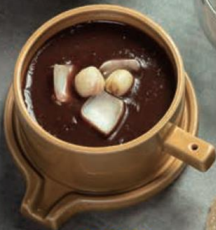
莲子百合红豆沙 Sweet Red Bean Soup with Lotus Seeds and Lily Bulbs