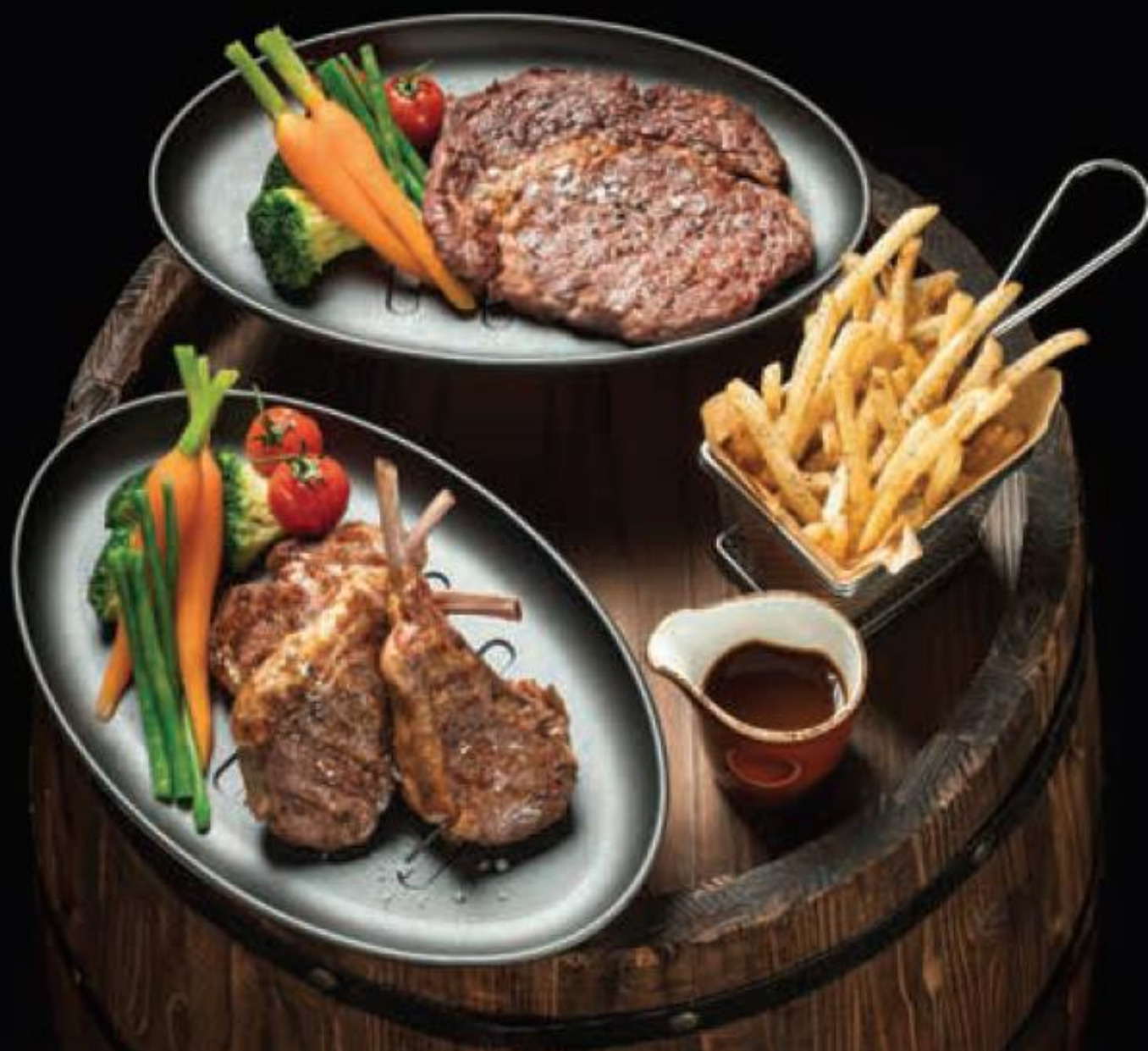
澳洲羊架 Australian Lamb Rack