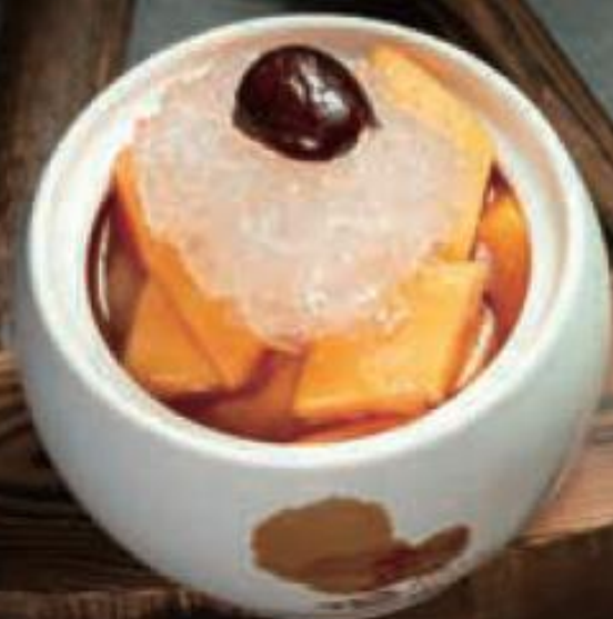
夏威夷木瓜炖燕窝 Double-boiled Bird's Nest with Hawaiian Papaya