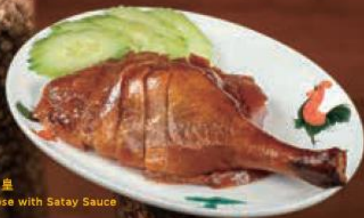
沙茶烧鹅皇 Roast Goose with Satay Sauce