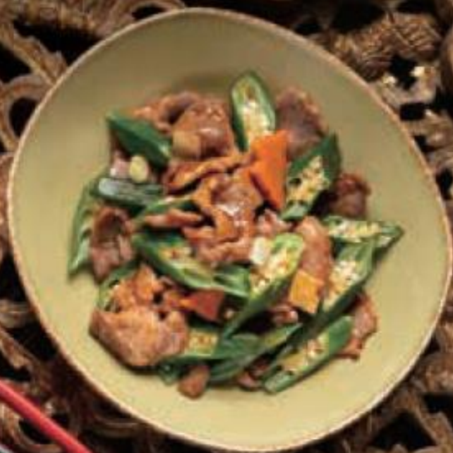
烧汁黑豚肉炒秋葵 Stir-fried Iberico Pork with Okra and Brown Sauce