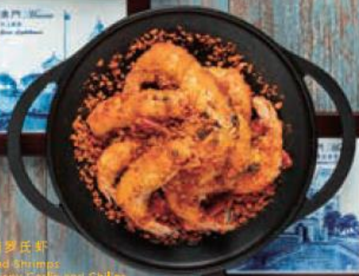
薑蔥焗罗氏虾 Stuffed Shrimps with Crispy Garlic and Chillies