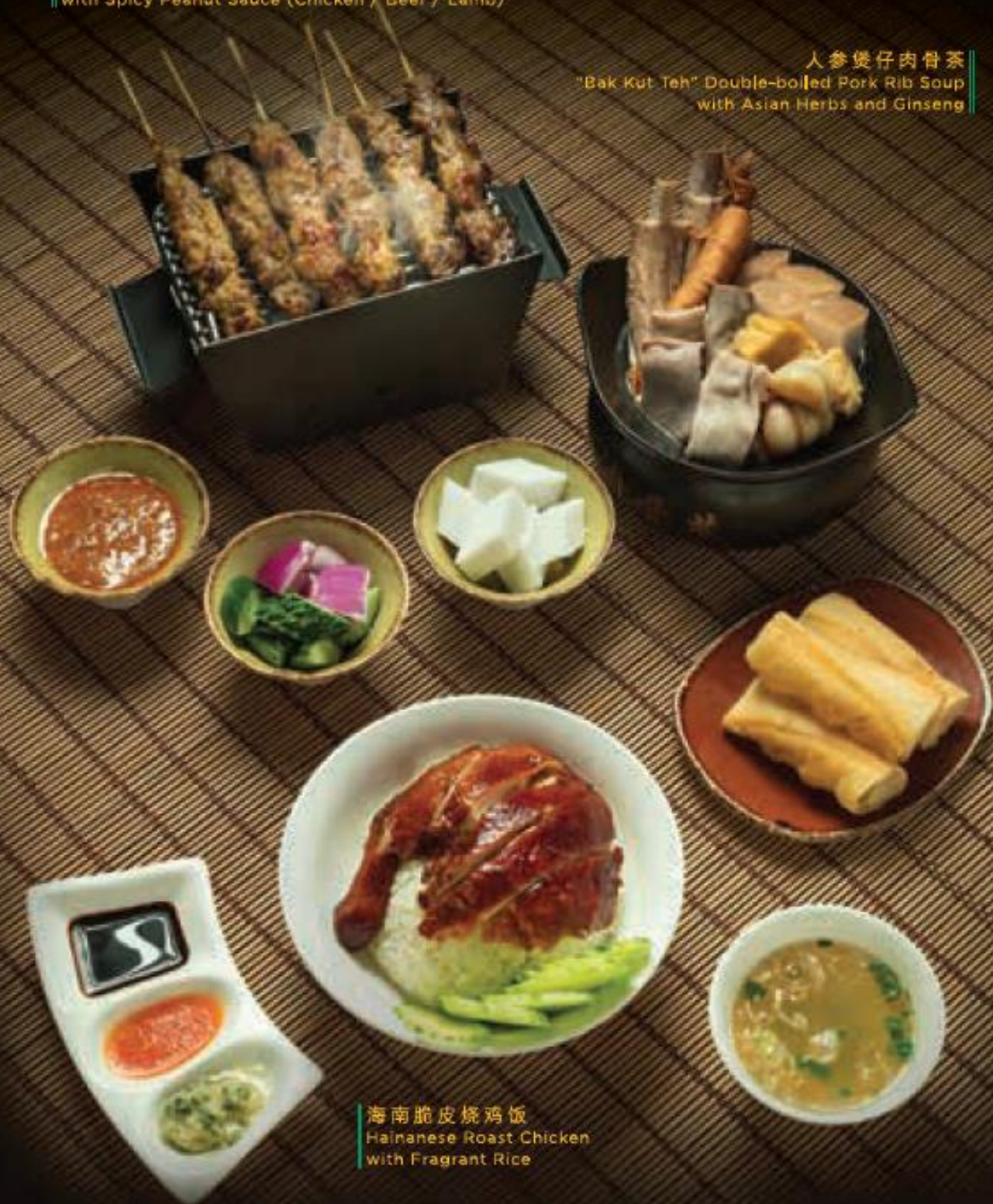
海南脆皮烧鸡饭 Hainanese Roast Chicken with Fragrant Rice