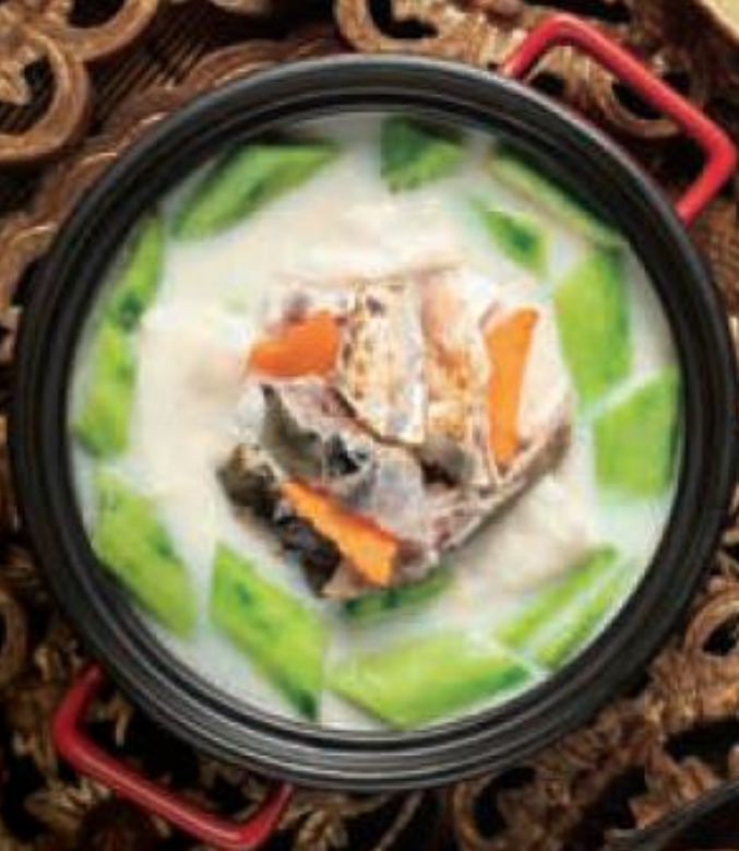
竹笙胜瓜浸鱼云 Poached Fish Head with Luffa and Conpoy in Superior Broth