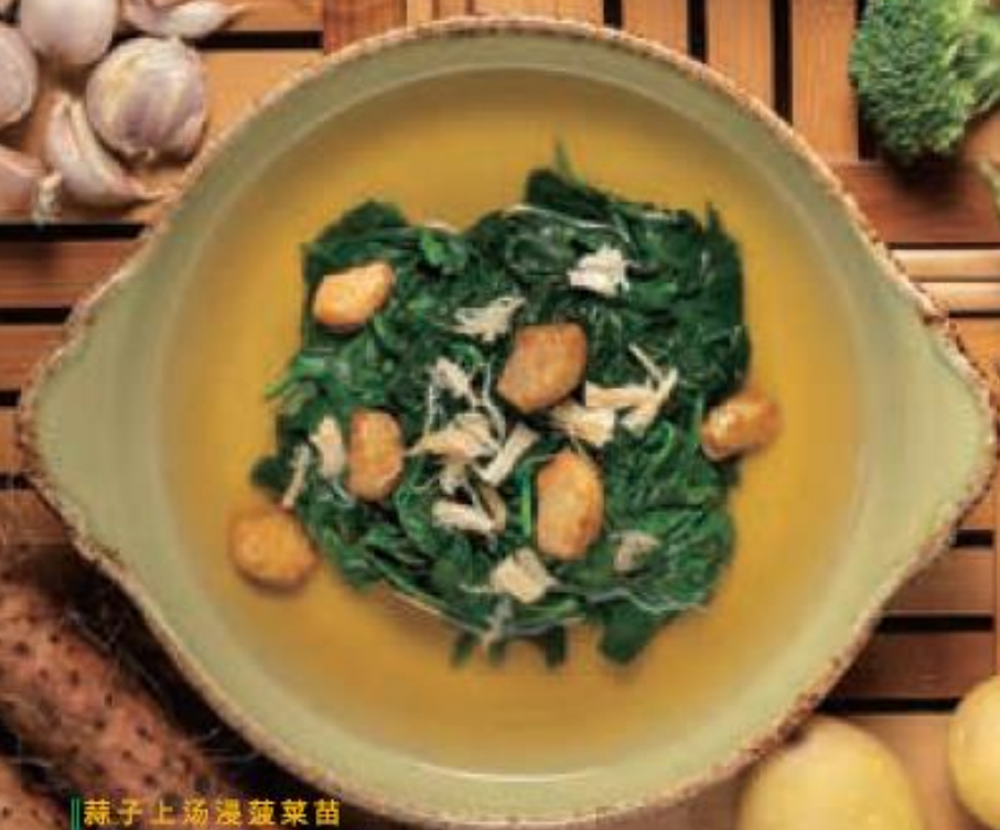
蒜子上汤焯菠菜苗 Poached Baby Spinach With Roasted Garlic in Superior Broth