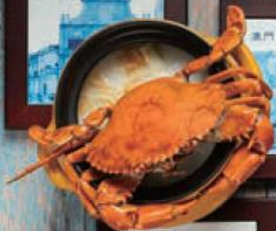
生滾水蟹粥 Fresh Water Crab Congee