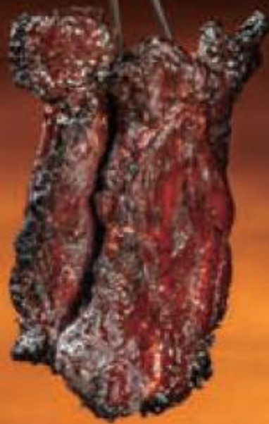
招牌炭烧黑豚叉烧 Signature Honey Glazed Barbecued Iberico Pork