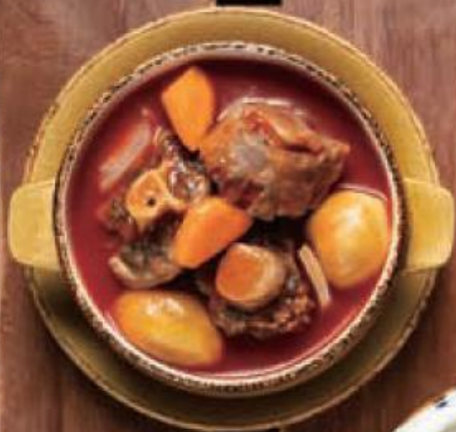
鲜茄牛尾汤 Fresh Tomato and Oxtail Soup