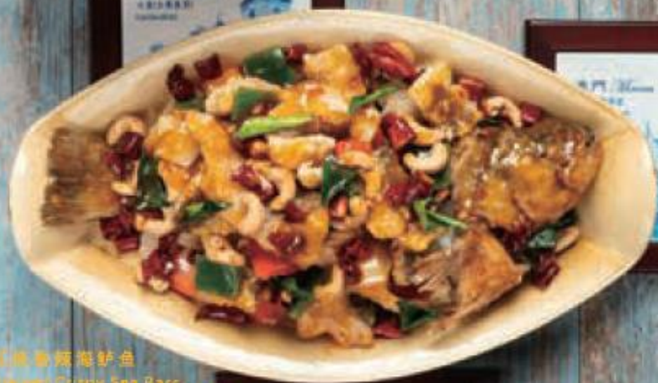
紅燒椒鹽海鲈鱼 Braised Crispy Sea Bass with Spicy Sauce and Cashew Nuts