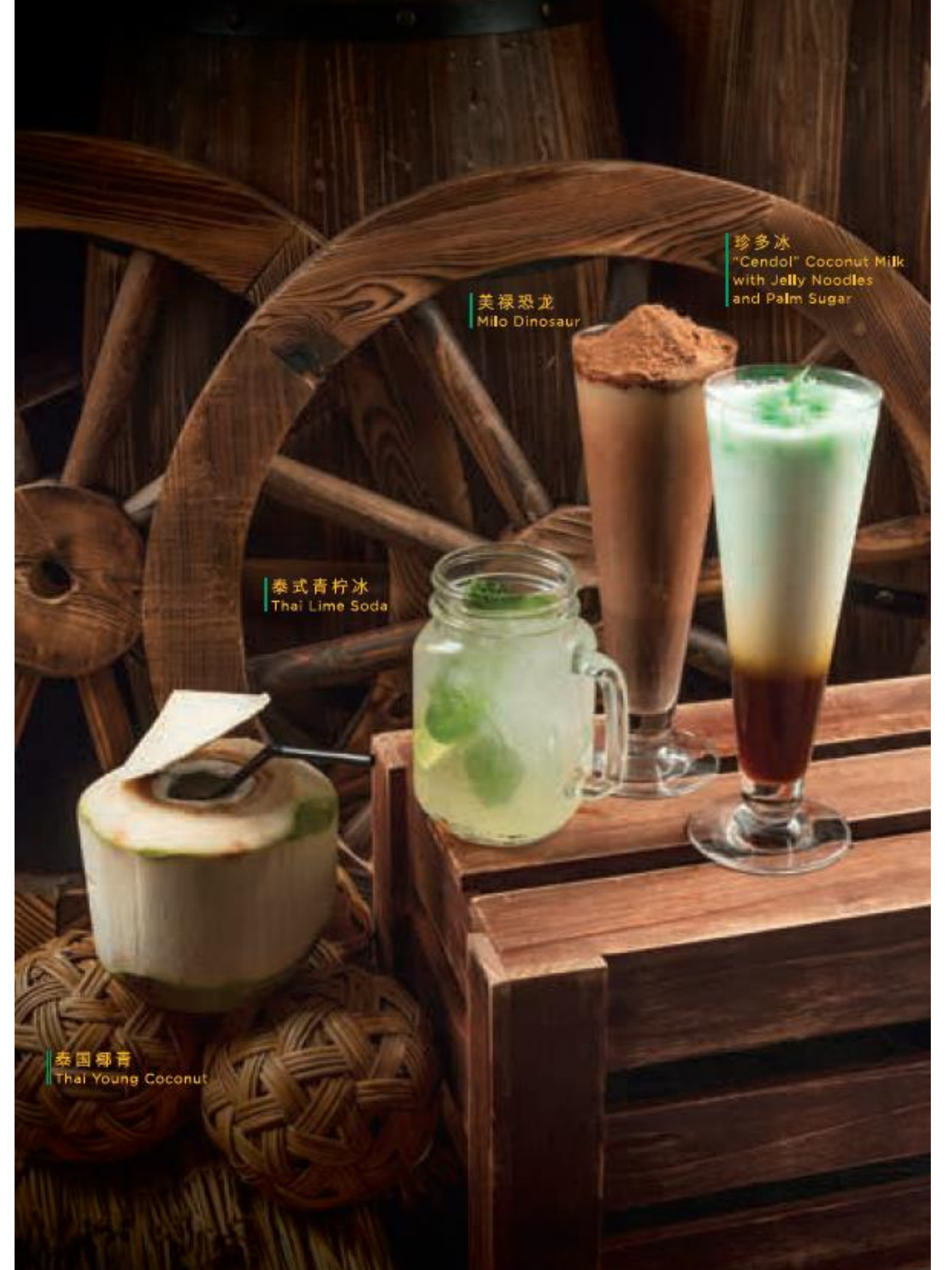
泰国椰青 Thai Young Coconut