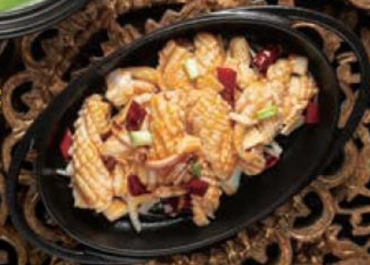
铁板酱爆鲜鱿 Grilled Squid with Onion and Chili Sauce